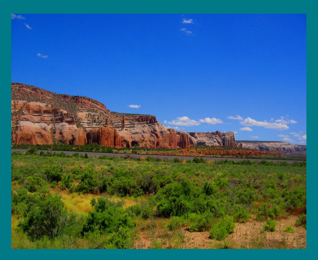
Image: New Mexico scene of red rock formation in the background, green and yellow desert plants in foreground, and blue skies.

Alyx Medlock, M.S., CCC-SLP NM LEND Training Director